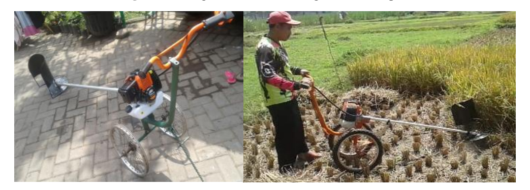
Figure 2: Testing of Rice Harvesting Machine After Repair

After repairs to work facilities, data collection and processing are carried out related to the comfort of limbs by using questionnaires to operators of rice harvesting machines. The results of data processing showed that there was a decrease in pain complaints after using the new rice harvesting machine, as shown in the following table.